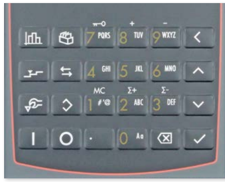
Intuitive keyboard with direct commands. IP 64 protection.