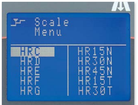
Set of the hardness test methods