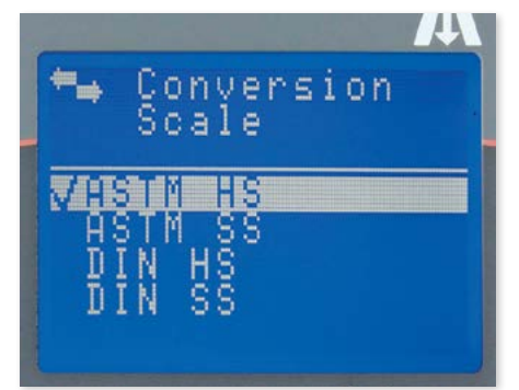
Conversion scales tables