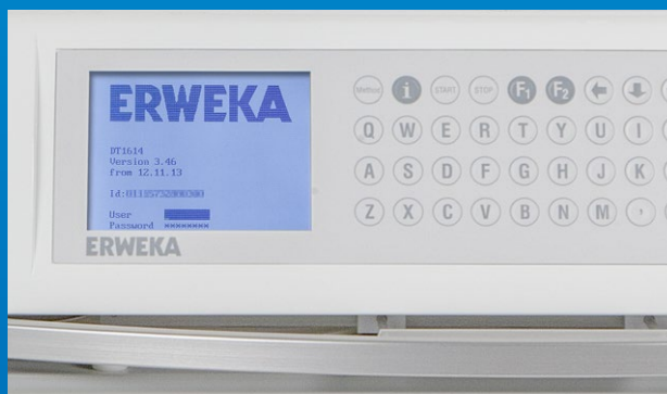
The DT 1610 Series comes with built-in intelligence for full system control