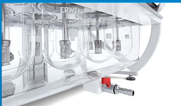
Easy to clean one-piece moulded water bath with outlet valve