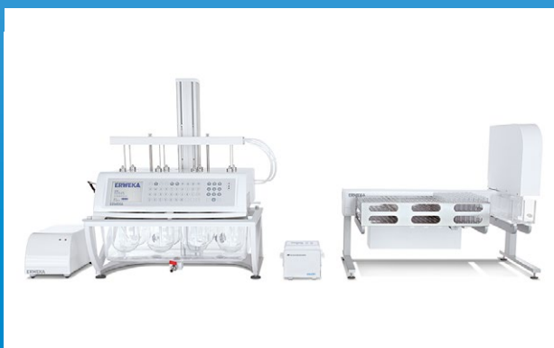
The DT 828 with optional automated sampling station controls offline system