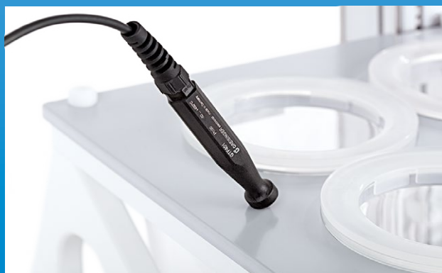
Electronic temperature sensor for permanent check of bath temperature