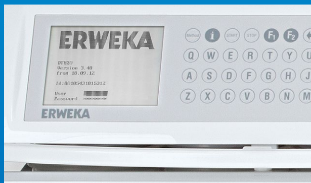
The DT 820 series comes with built-in intelligence like large memory and system suitability tests