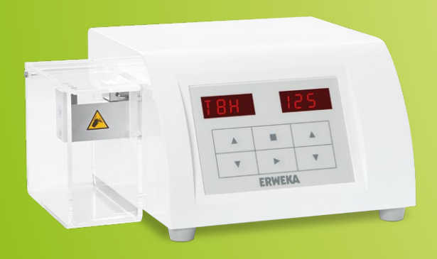
TBH 125 with collection container