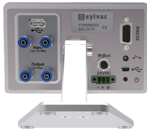
D70A - 2 inputs