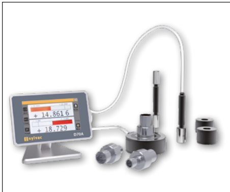
D70A with air and plug gauges