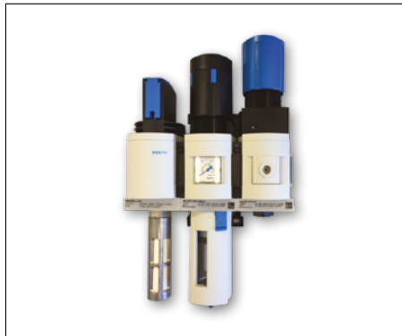
Air kit for D70A (804.2203)