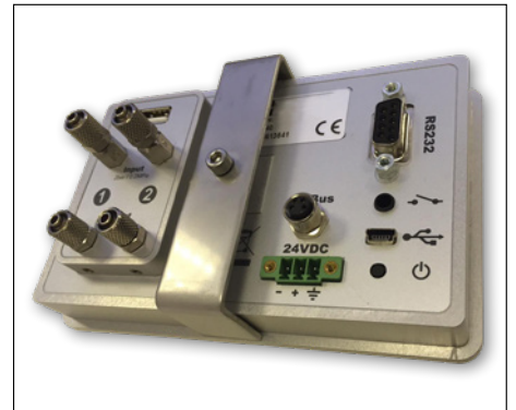
D70A with accessory 804.2202 (panel mounting)