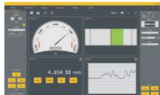
Multi-channel display with colour-coded tolerances