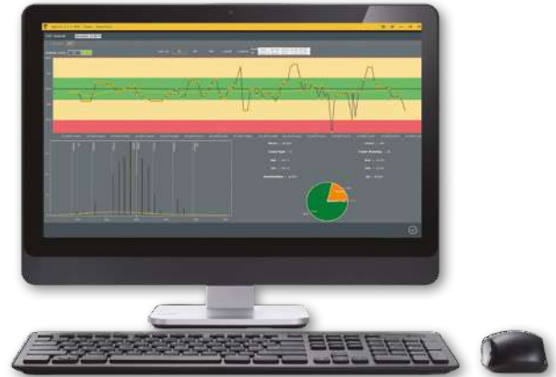
Free Sylcom LITE version on www.sylvac.ch

The concept is to offer a modular software application based on the specific functionalities required.