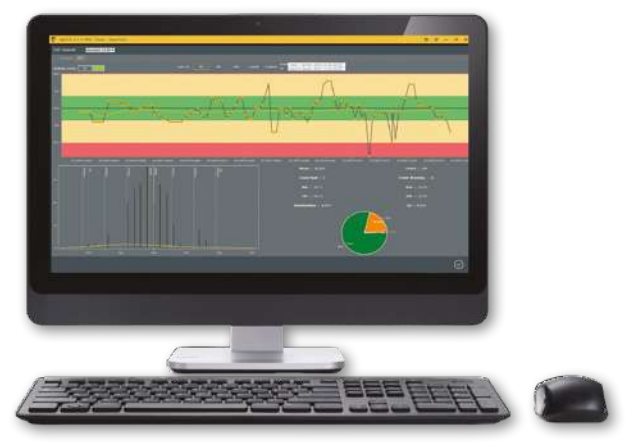
Free Sylcom LITE version on www.sylvac.ch

The concept is to offer a modular software application based on the specific functionalities required.