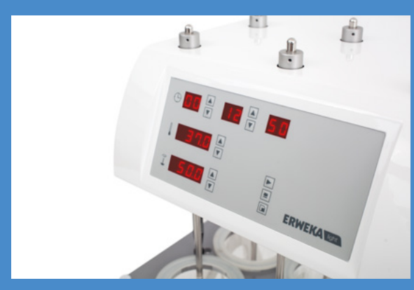
LED display and symbol keypad for easy control